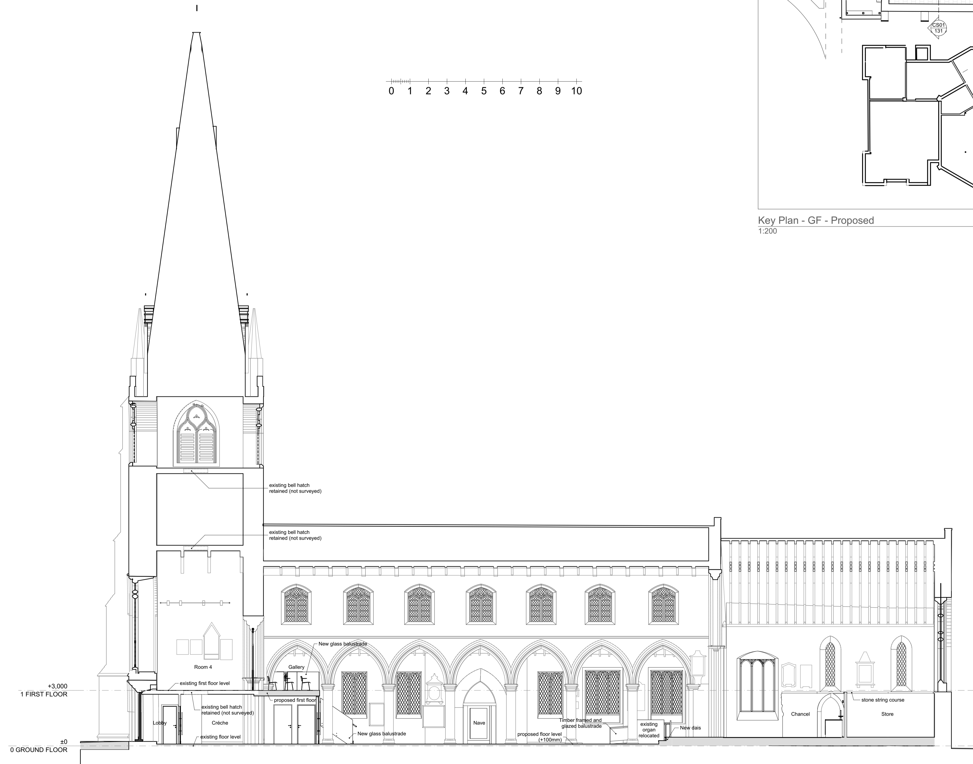
Section 2 - Proposed - Longitudinal 1:100