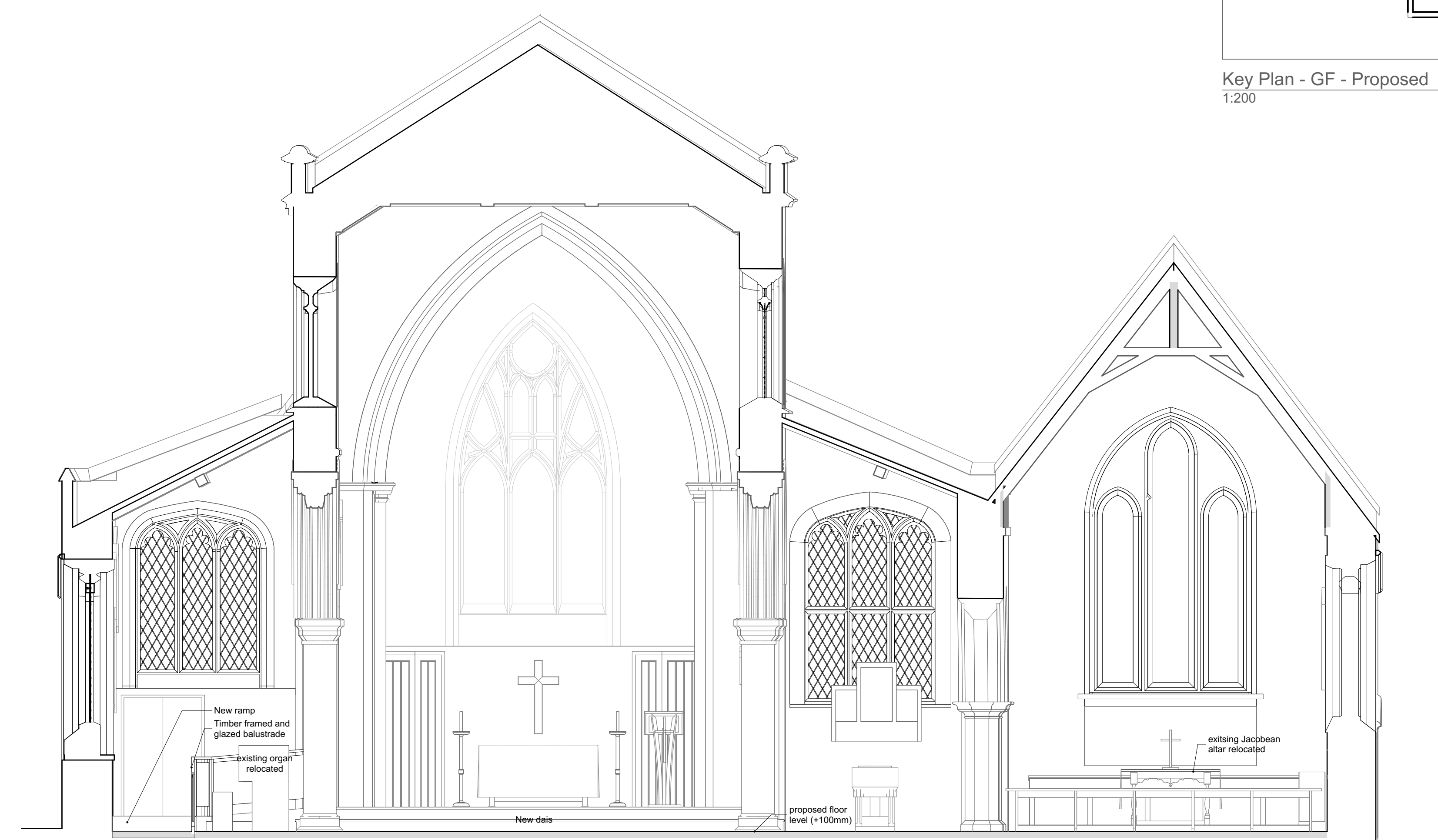
Section 3 - Proposed - East End 1:50