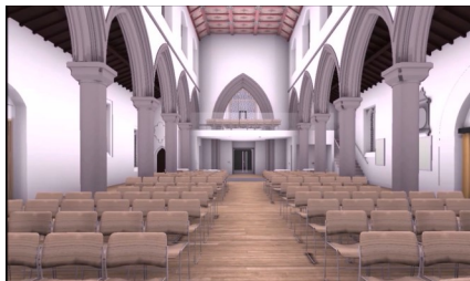
Artist impressions of the transformed church

If you would like more information about the background to the Building Transformation Project, and see the plans and video, please visit our website: