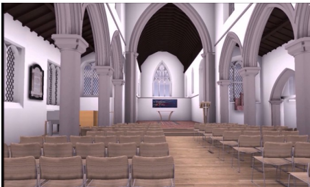
Looking forward to the east end

SO WE NEED YOUR SUPPORT, PRAYERS AND HELP BY RESPONDING TO THE SURVEY. THANK YOU!